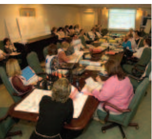
The team and the Incident Command Center during a drill.